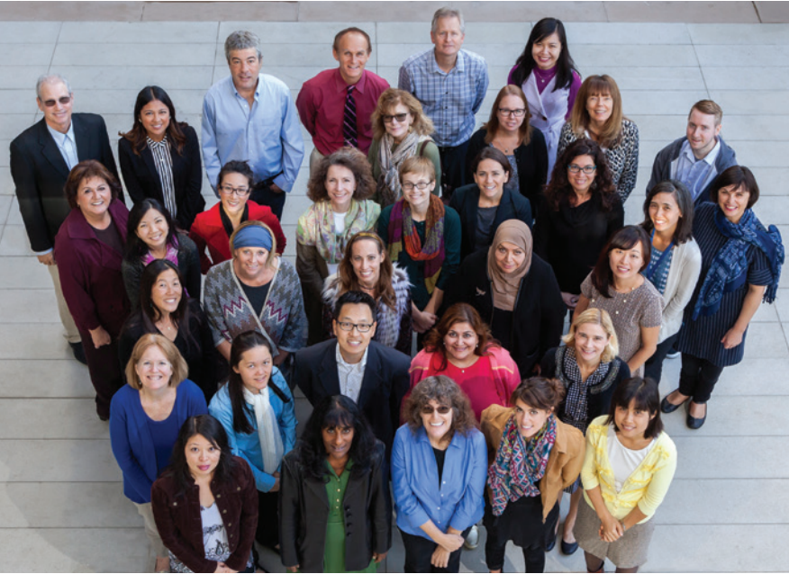
UCI ESL instructors and TEFL trainers.

If you want to enhance your professional teaching goals or are already enjoying a career teaching English, select UCI's certificate programs, ACP Teaching English as a Foreign Language (TEFL), or our custom-designed English-Mediated Instruction (EMI) program.