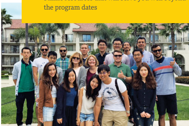
Business English Field Trip at Hyatt Regency for Tour and Talk